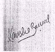
(Scanned Image of Signature)