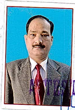
DISTRICT JUDGE BAHRAICH