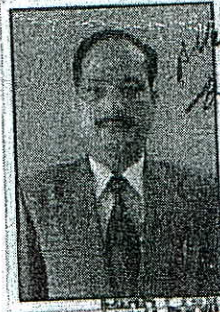
Registrar (Judicial Budget) High Court, Allahabad