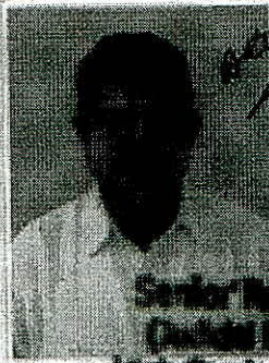
Senior Registrar (Judicial) (Budget) High Court, Allahabad