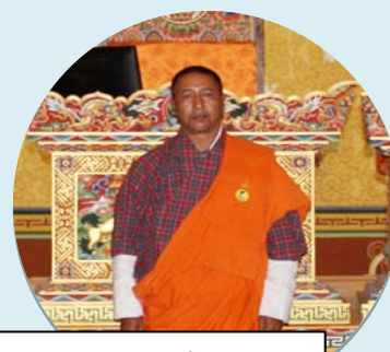
Judges, Supreme Court of Bhutan

Foreign Students' Advisor of the University handles all enquiries regarding rules and responsibilities for admitting Foreign Students. Therefore, the applicants should approach: FOREIGN STUDENTS' REGISTRY OFFICE Room No. 11, First Floor, Conference Centre, University of Delhi, Delhi-110007 Phone No: 011-27666756 E-mail : fsr_du@yahoo.com ; fsr@du.ac.in Dealing Timings: 09.30 am - 1 pm & 2.00 pm - 5.00 pm (Office will remain closed on Saturdays, Sundays and all Public/ Gazetted Holidays)