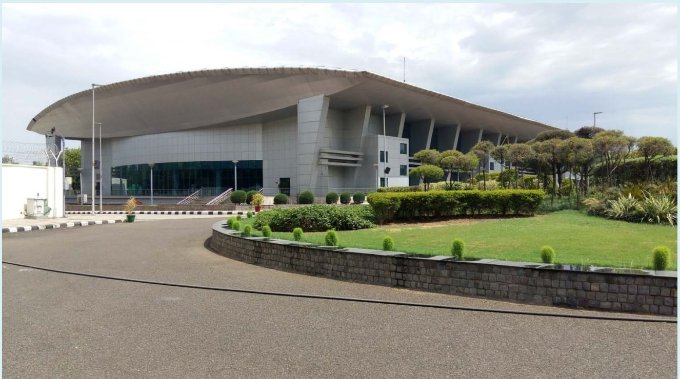
Multi-Purpose Hall of Delhi University