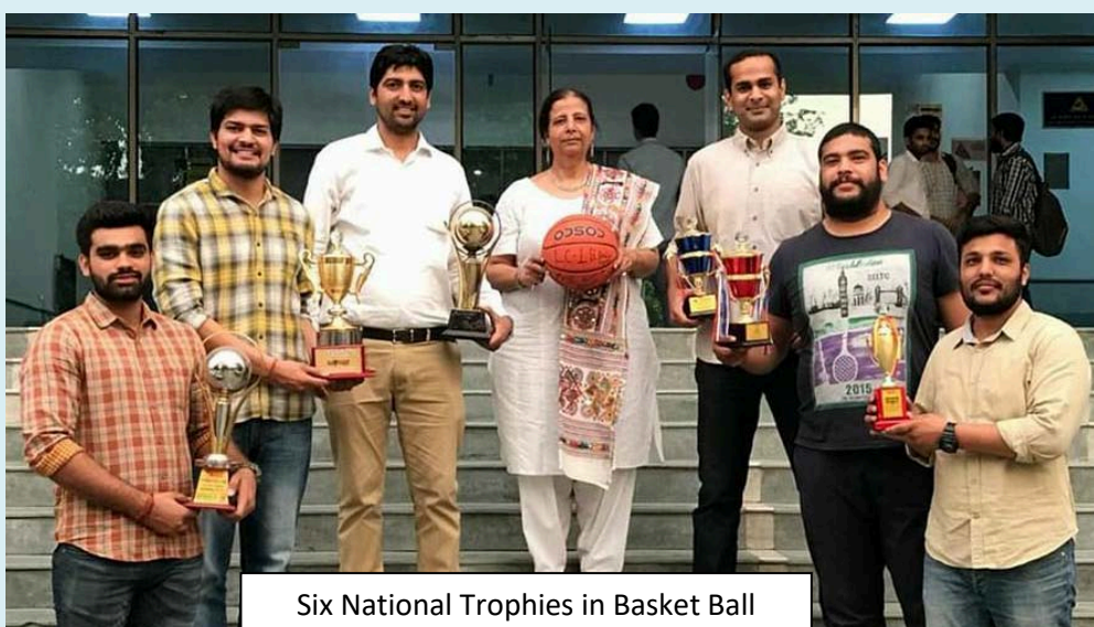
Six National Trophies in Basket Ball 2017-18

Subject to the provisions contained in the Ordinance relating to ex-students as in force from time to time, a student must clear all the courses offered in all the Terms within a span period of at the most six years from the date of admission to first year of the LL.B. course. No student shall be admitted as a candidate for any LL.B. examination after six years from the date of admission to the first year of the course.