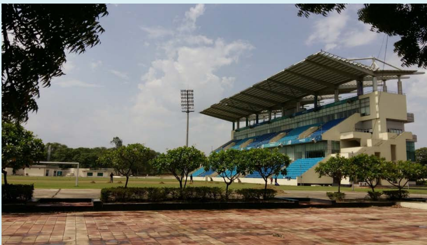
Rugby Stadium of Delhi University

On-Line Registration Fee For LL.M. Entrance test for SC/ST/PwD candidates is Rs. 250/- and for all others (Unreserved, OBC, CW) it is Rs.500/-. The fee is non-refundable.