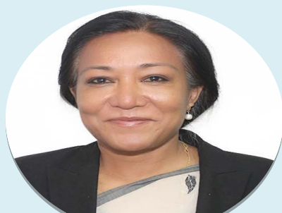
Judge, Supreme Court of Nepal

Foreign Students' Registry is the single window for all the foreign nationals who wish to seek admission in University of Delhi in different programmes. For more details, see, ( http://fsr.du.ac.in/ ). Foreign nationals seeking admission in LL.B., M.C.L. and Ph.D. programmes are exempt from entrance test. Foreign nationals fulfilling the eligibility criteria may be registered for Ph.D. over and above the maximum admissible strength. However at any given time, the total number of foreign students shall not exceed 10% of the total admissible strength of the department. Foreign nationals must provide evidence of English language competence if they wish to join Faculty of Law for any course. Foreign nationals are exempted from entrance test and interview for admission to Ph.D. Programmes. They may be admitted based on their research proposal, subject to fulfilling the minimum eligibility criteria. The decision regarding the same rests with the Department Research Committee (DRC) subject to approval from Board of Research Studies (BRS) for the Ph.D. Programme. Foreign student alumni of Faculty of Law are holding very high positions including judges of the Supreme Court, High Commissions, and other national level institutions of their country.