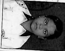
TIS HAZARI TIS HAZARI COURT COMPLEX