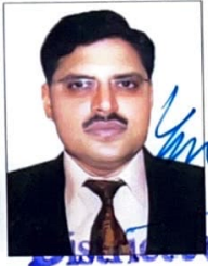
Justice Hamirpur (U.P.)