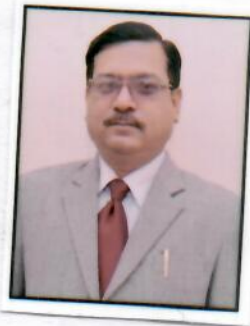
Photo of Shri Umesh Chandra Pandey-II Special Judge Special Court (PC-1) Bareilly