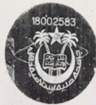
Photo Copy Attached R.I.G.S. er

प्रथम अपर जनपद एवं सत्र न्यायाधीश बदायूं