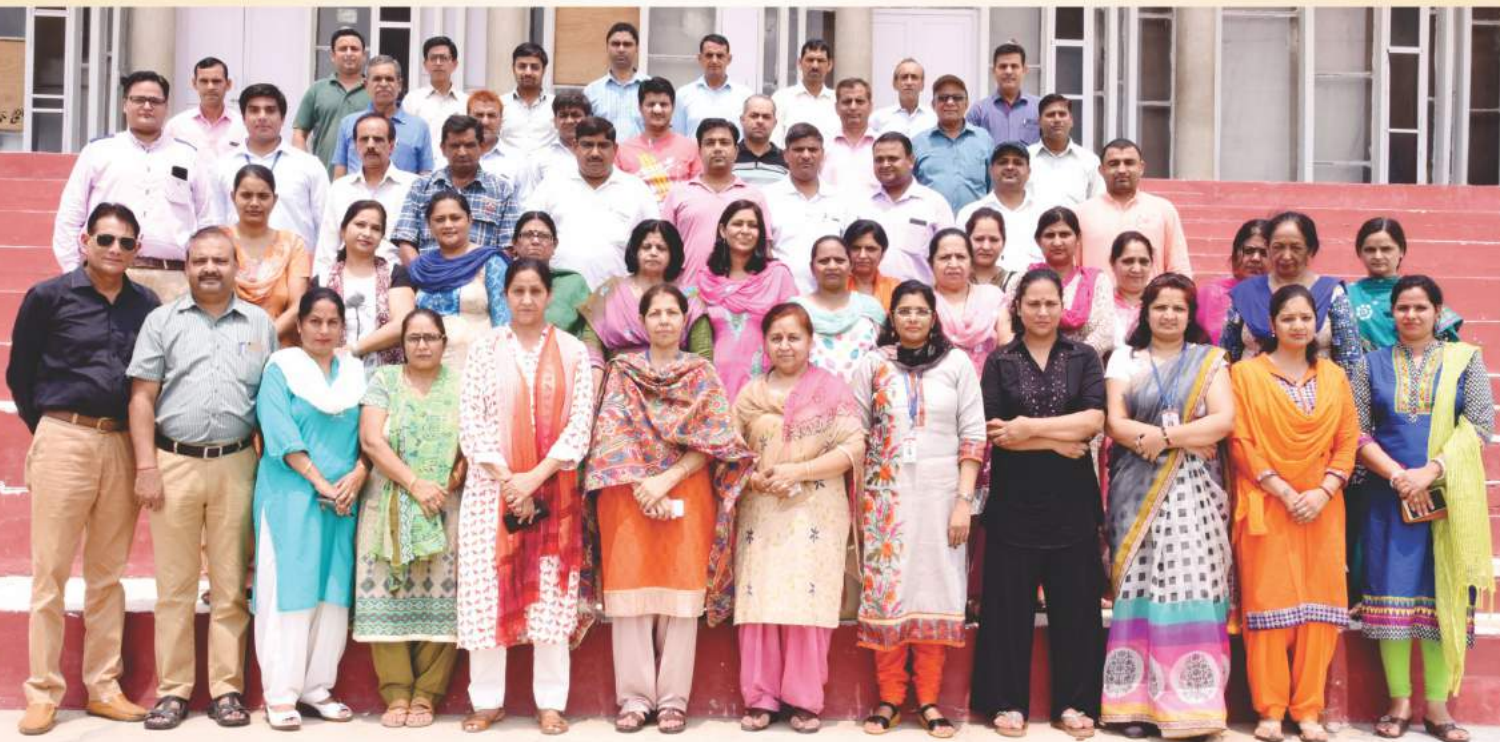
Team of Directorate of Distance Education, Kurukshetra University, Kurukshetra

To evolve a seamless system of higher distance education for sustainable life-long learning and up gradation of knowledge and skills by use of innovative approaches.