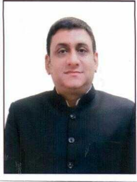
Four Photographs of Applicant