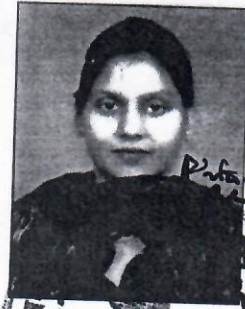
Photo attested by ACSM II Allahabad