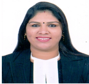
(Scanned Photograph of the candidate)

Undertaking: I have gone through the advertisement and the Instructions mentioned therein and fulfil all the conditions/requirements specified therein. I hereby Accept and confirm the Undertaking.