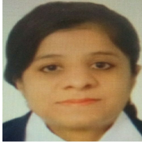
(Scanned Photograph of the candidate)

Undertaking: I have gone through the advertisement and the Instructions mentioned therein and fulfil all the conditions/requirements specified therein. I hereby Accept and confirm the Undertaking.