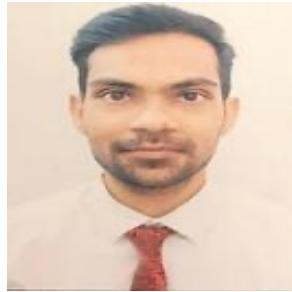
(Scanned Photograph of the candidate)

Undertaking: I have gone through the advertisement and the Instructions mentioned therein and fulfil all the conditions/requirements specified therein. I hereby Accept and confirm the Undertaking.