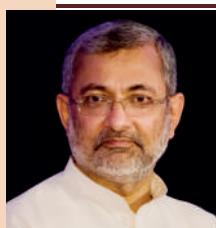
Hon'ble Justice Kurian Joseph

Former Chief Justice of Himachal Pradesh, Former Judge, Supreme Court of India