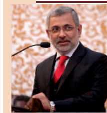
Hon'ble Justice Kurian Joseph

Chief Justice of the Supreme Court of Sri Lanka