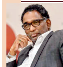
Hon'ble Justice Jasti Chelameswar

Former Chief Justice of Himachal Pradesh, Former Judge, Supreme Court of India