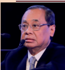
Hon'ble Justice Ranjan Gogoi

46th Chief Justice of India MP, Rajya Sabha