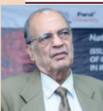
Hon'ble Justice C. K. Thakker