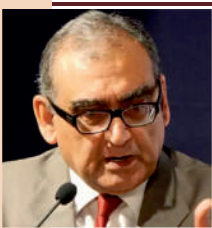
Hon'ble Justice Markandey Katju

Former Chief Justice of Himachal Pradesh, Former Judge of Supreme Court