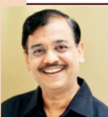
Padma Shri. Ujjwal Nikam