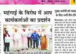
महंगाई के विरोध में आप कार्यकर्ताओं का प्रदर्शन

भाजपा नीकरिया नहीं देना चाहती इसी के चलते पेपर लीक कराय जा रहे है। उन्होंने कहा कि सपा की विचारधारा समाज को आगे बढ़ाने की है। उतर प्रदेश जो तप करेगा खरी देस का भविष्य होगा। उन्होंने कहा कि फिरोजवादा समाजवादी का गढ़ है, तो बात भी हमारी ही होगी। समाजवादियों ने अपनी सरकारों में