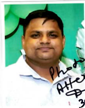
Photo Attached 30.07.2020 SESSION JUDGE BAREILLY