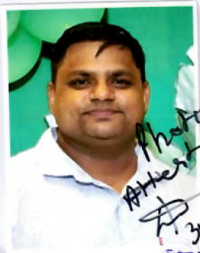
Photo Attached 30.07.2020 SESSION JUDGE BAREILLY