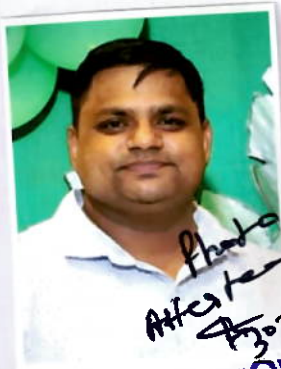
Photo Attached 30.07.2020 SESSION JUDGE BAREILLY