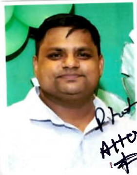
Photo Attached 30.07.2020 SESSION JUDGE BAREILLY