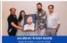
AN INNOVATIVE AND RASB AICTE & ISO 9001:2015