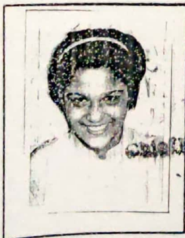
हस्ताक्षर/नि. अंगूठा व फोटो प्रमाणित