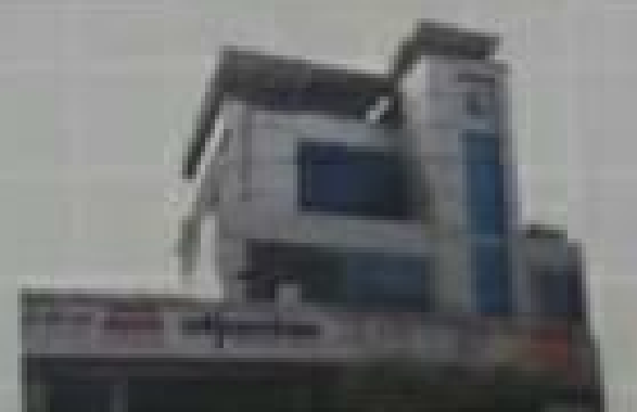
Most Advance Pathology & Hormone Lab of Whole Tara & Rohildand Region