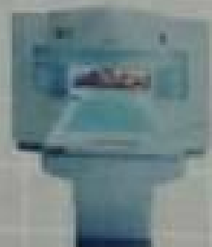
LATEST 3 TESLA HITACHI High Performance Premium Cool MRI World Latest Ultra Low Dose Real 22 Slice Per Sec. CT Scan

THIS IS AN OPINION NOT THE DIAGNOSIS, PLEASE CORRELATE CLINICALLY, REPORT IS NOT VALID FOR MEDICO-LEGAL PURPOSE