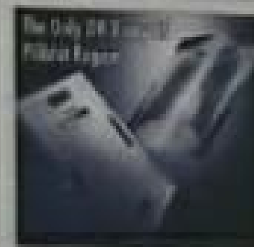
DR DETECTOR X-RAY