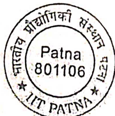
Assistant Registrar (Academic)