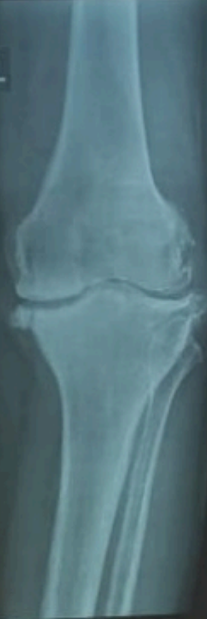
B/L KNEE AP VIEW