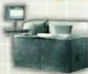
Siemens Dimension Xpandplus Fully Automated Biochemistry Biochemistry Analyser