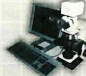
Digital Video Microscope