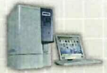
Automatic Blood Cell Counter Sysmex-xs-800i