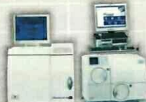
BacT/ALERT 3D-60 & Vitek-2 Compact The Most Comprehensive Microbiology Culture Bench