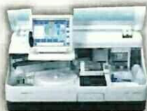
Roche Cobas e411, Electrochemiluminescence Analyzer

कुमायूँ एवं तराई क्षेत्र का सबसे बडी पैथोलौजी एवं हारमोन लैब