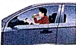
Don't Mix Drinking and Driving

Be Responsible, Be Safe :: Your Safety is our Concern