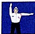
Follow Traffic Signals