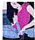
Always Wear your Safety Belts