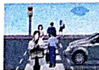
Pedestrians have first priority on Roads