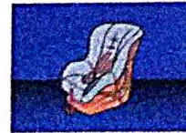
Please use Child Seats when Children are seated in front of Airbags